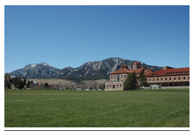
Figure 1. The Boulder campus is located just a few miles from the Rocky Mountains.

The campus of University of Colorado at Boulder is located at the center of the fairly small and beautiful town of Boulder, Colorado. The university is one of the highly ranked universities in USA and has in the recent years received several Nobel prizes.