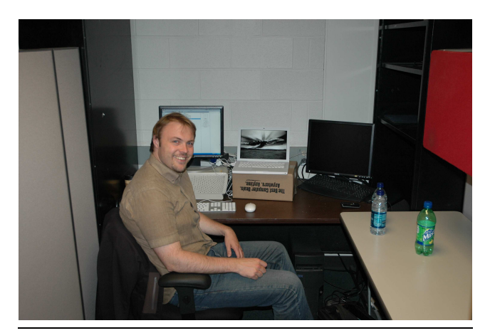
Figure 3. My small personal office cubicle where I spent many productive hours. Please notice the bottle of Mountain Dew to the right hand side, which kept me focused for hours.

There was a good atmosphere in the group and several of the other PhD students were working with