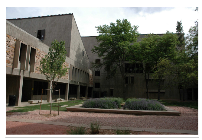
Figure 2. The engineering building, which hosts the department of Electrical and Computer Engineering.

The campus is located at walking distance from the Rocky Mountains (see Figure 1), which offers various outdoor activities. The campus area has unique architecture with buildings made out of red rocks. The only exception is the engineering building (Figure 2), which is mainly built of concrete. This is the building where the department of electrical and computer engineering is located and where I spent most of my time.