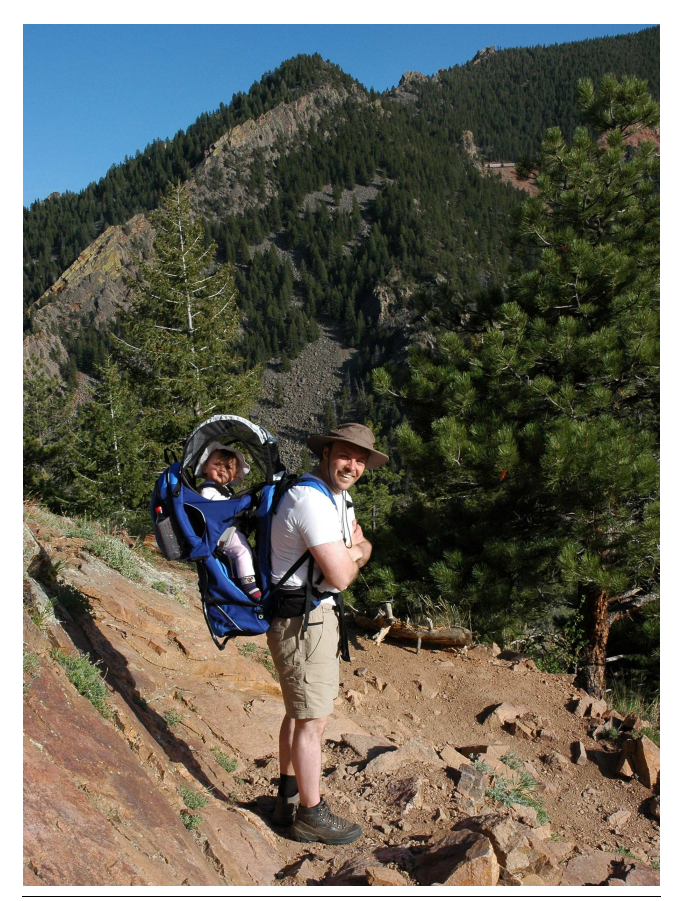
Figure 4. Hiking with my daughter and wife in the Rocky Mountains was one of the main activities during the weekends.

pecially how to make type soundness proofs on typed lambda calculuses defined with small-steps semantics.